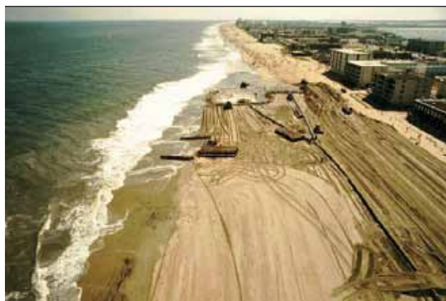
Beach nourishment projects repair erosion while increasing the distance between vulnerable coastal infrastructure and breaking waves, while dunes protect against wave energy and flooding.