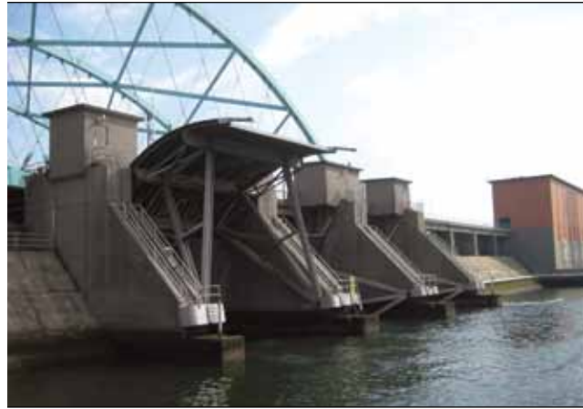
Hard structures like this Fox Point Hurricane Barrier in Providence, Rhode Island, are likely to become increasingly important to reduce coastal risk, particularly in urban areas where there is not enough space for nature-based strategies.

The report considers two approaches: (1) a risk-standard approach that recommends investments to achieve an acceptable level of risk reduction, such as reducing the threat of loss of life or the probability of severe flooding; and (2) a benefit-cost approach that recommends investments when the benefits of the investment exceed the costs. The report concludes that a benefit-cost approach, constrained by acceptable risk provides a reasonable framework